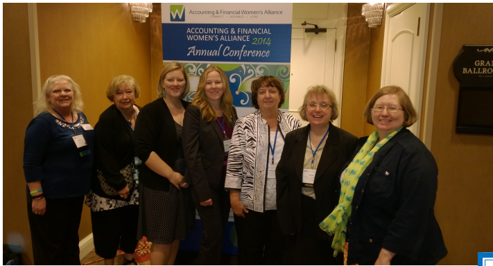
AFWA Annual Conference New Orleans, LA