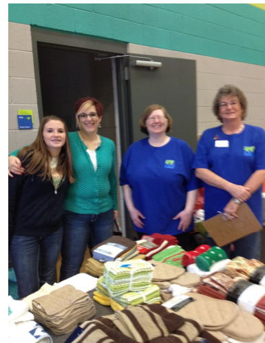
Volunteers helping at ICAN