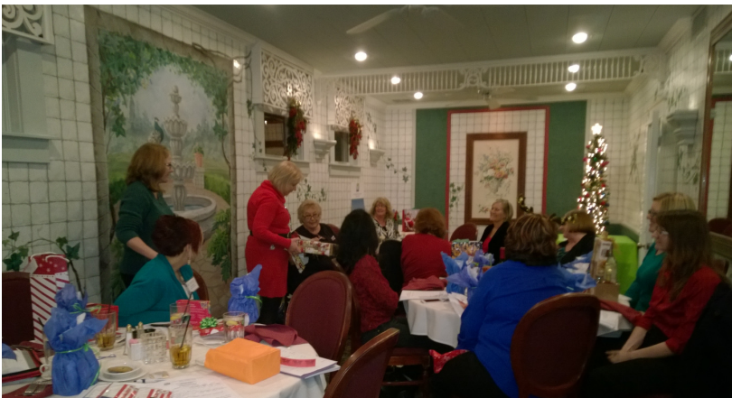
Our annual holiday gift exchange!